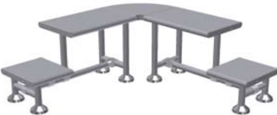
2 x swing over bench with 1 x 90 degree connector

Having difficulty putting on your shoe covers? The Swing Over Bench Eliminates back bending!