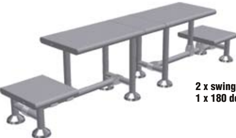
2 x swing over bench with 1 x 180 degree connector