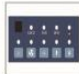
Microprocessor Control Users can control the fan, light, UV and adjust the air velocity with it.