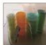
Soft Wall Material PVC anti-static dustproof curtain.