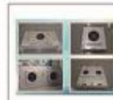
FFU(Fan Filter Unit), which draws in contaminated air from the top of the module, and exhausts filtered clean air vertically in a unidirectional (laminar) air stream at its base, is a self-contained fan and filter module for clean room applications.