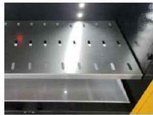
Shelf and PP tray